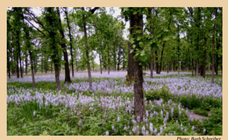
Wild Hyacinth in Wolf Road Prairie Savanna