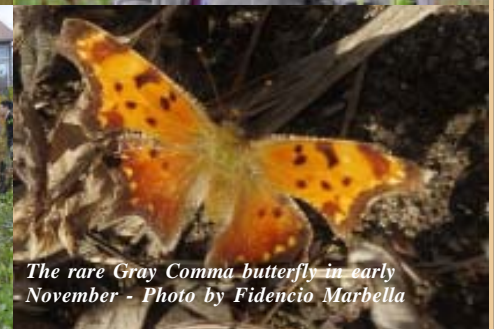
The rare Gray Comma butterfly in early November