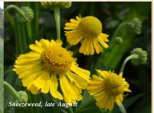
Sneezeweed, late August