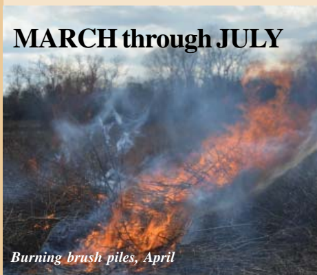
Burning brush piles, April