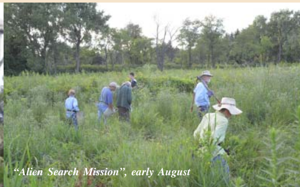
"Alien Search Mission", early August