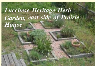
Lucchese Heritage Herb Garden, east side of Prairie House