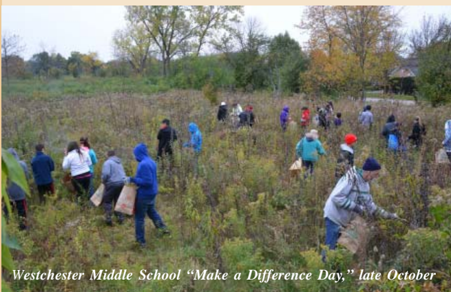
Westchester Middle School "Make a Difference Day," late October