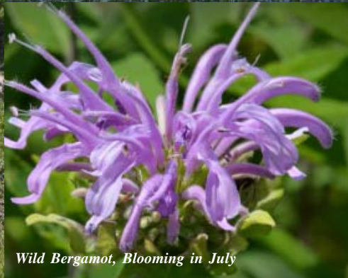
Wild Bergamot, Blooming in July

S TPS volunteers spent many hours tracking down the alien Reed canary grass and cutting off the seed heads, followed up with herbiciding. A search was made for Sweet clover and Garlic mustard which was pulled wherever it was found. Generous volunteers from the Hillside Carmax also cut brush along the northern border of the preserve. Kristin Pink's Report for the Forest Preserve District of Cook County (FPDCC) early March: Brush mowing by staff in blocks 407-408. March 23: Prescribed burn by staff in north marsh blocks 401-403, 405-407. May-June: Canada thistle herbicide application by staff in blocks 409-411. June: Reed canary grass seed head removal by FPDCC staff and Greencorps Chicago, concentrating in blocks 409-413; limited RCG herbicide treatment by FPDCC staff. (Greencorps Chicago is the City of Chicago's green industry job training program for individuals with barriers to employment). June-July: Teasel seed head removal and Sweet clover pulling by staff throughout the site.