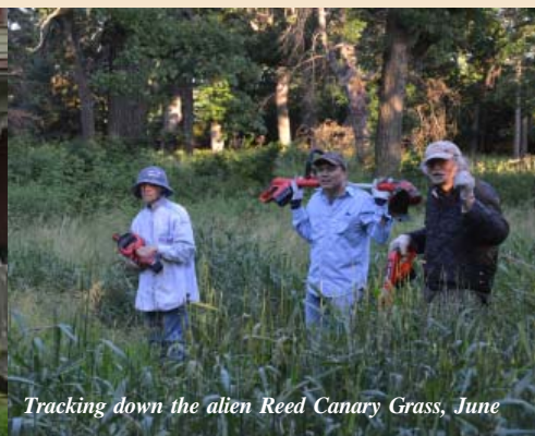
Tracking down the alien Reed Canary Grass, June