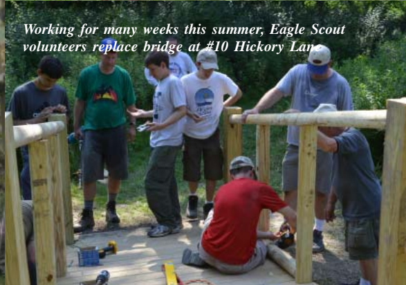
Working for many weeks this summer, Eagle Scout volunteers replace bridge at #10 Hickory Lane