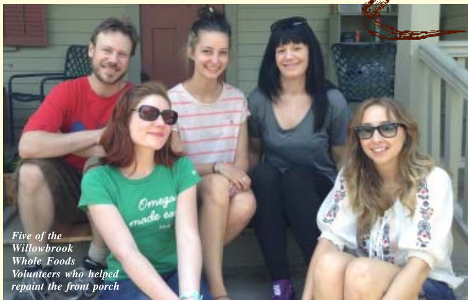
Five of the Willowbrook Whole Foods Volunteers who helped repaint the front porch

Bricks purchased for house walkway in 2013. (Lettering not to scale)