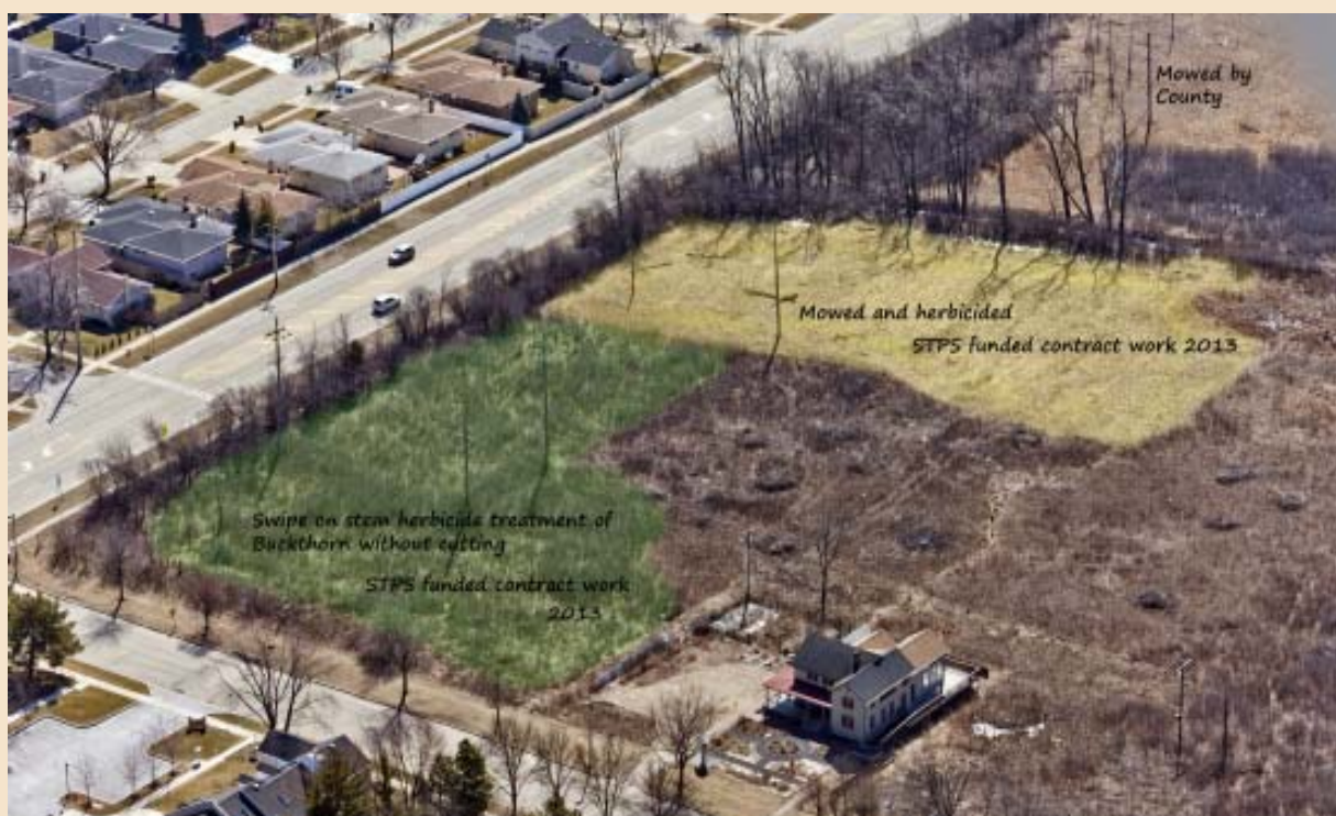
Above: Aerial photo by John Hill of Tiger Hill Studios, March 2013 showing managed areas of WRP: Green - swipe on stem herbicide treatment of Buckthorn without cutting, STPS funded contract. Yellow - mowed and herbicided by STPS funded contract. Upper right corner, mowed by Forest Preserve Dist., Cook County.