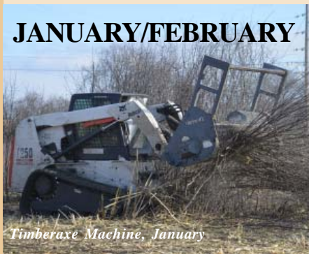
Timberaxe Machine, January