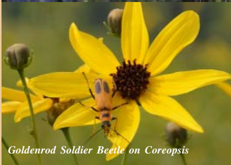
Goldenrod Soldier Beetle on Coreopsis