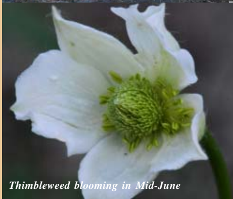
Thimbleweed blooming in Mid-June