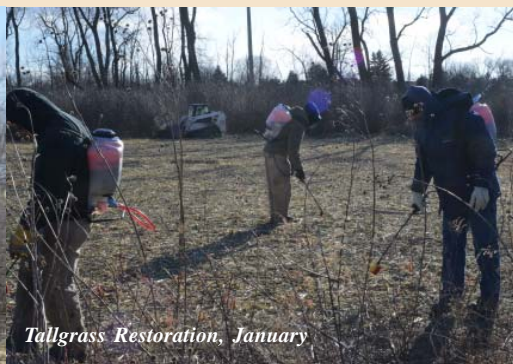
Tallgrass Restoration, January