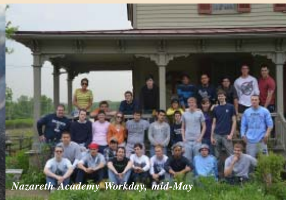
Nazareth Academy Workday, mid-May