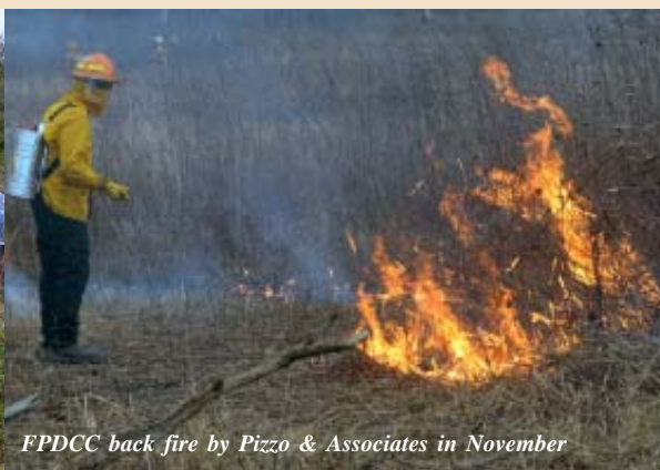
FPDCC back fire by Pizzo & Associates in November